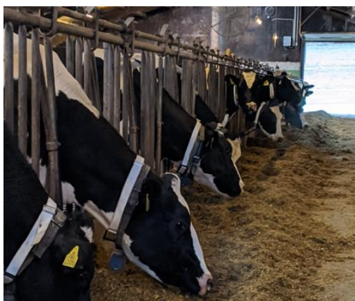
Herds with U-motion® in FarmTest

The proportion of cows with 8-17 days between two heat alarms is less than 5% of the cows.